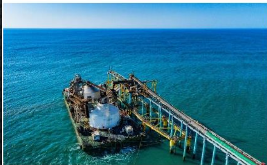
Moma's jetty and one of two transshipment vessels