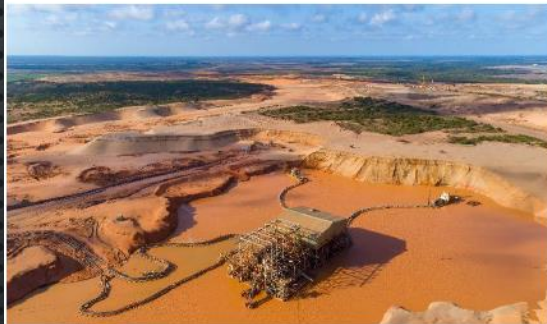
Wet Concentrator Plant (WCP) A