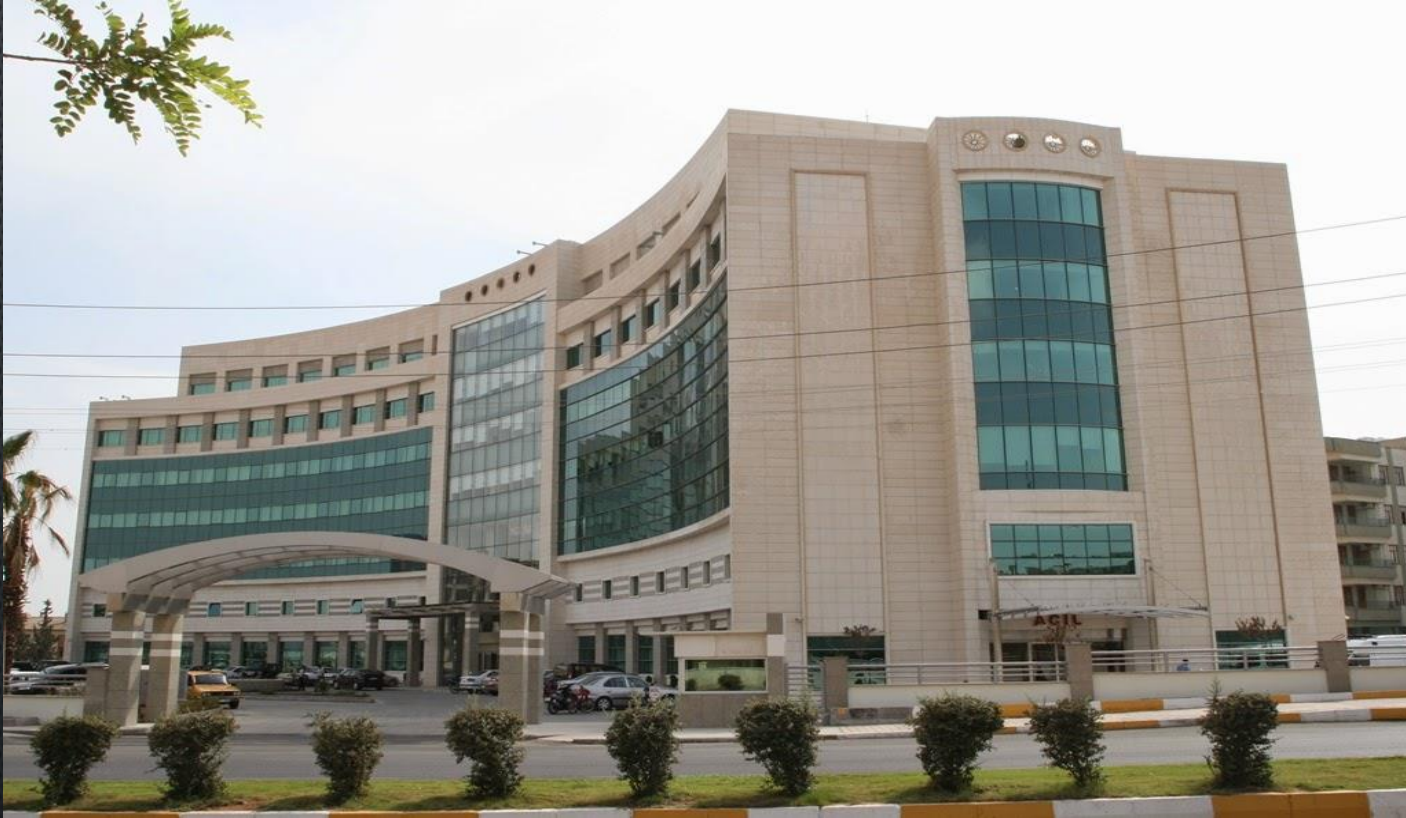
Şanlıurfa Uzmanlar Hospital Daikin VRV System Application